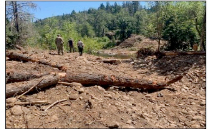
Side channel excavation with large woody debris. Logs donated by BLM and Hancock Timber- salvage from 2018 Miles wildfire that burnt 200+ ac in Elk Creek.

Community Impact: Interpretive signage was created to convey the importance of this ecosystem restoration project. Use of non-marketable timber salvaged from the 2018 Miles Wildfire that impacted over 52,000 ac in the local community.